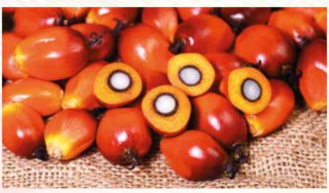
Cross section of the palm oil fruit with the palm kernel.

In this context, working conditions and the observance of land use rights are taken into account, areas worthy of protection such as rainforest areas and peat bogs are protected from uncontrolled expansion of oil palm plantations, and the rights of indigenous peoples are respected [4]. Currently 20% of all traded palm oil is RSPO certified [5].